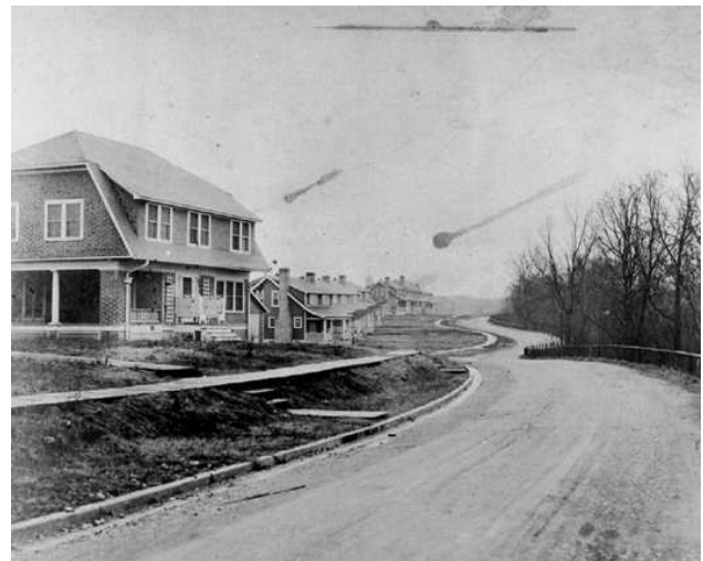
Riverside Road circa 1918

In the late 1940s, as company towns fell out of corporate favor, DuPont sold hundreds of the Old Hickory houses to the employees who had been renting them. Hundreds of other "temporary" houses, most of them then 30 years old, were razed. Floor plans on this year's Historic Old Hickory Village Tour include the Cumberland, Georgia, Haskell, Ketchum, and Arlington, plus two lakefront homes – an amazing 60s Contemporary and the Sugar Bowl house.