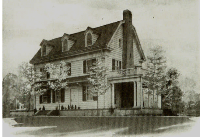
Plant Manager's house—"The Special Davis"

The historic neighborhood of Old Hickory has been called Nashville's "best kept secret," but it was anything but secret when it was built 88 years ago. In January 1918, as the "Great War" raged in Europe, the U.S. government contracted with the E.I. DuPont de Nemours Co. to build the world's largest gunpowder plant on 5,600 acres in the hairpin turn of the Cumberland River known as Hadley's Bend. By the time the war ended on Nov. 11 - barely 10 months later - more than 3,800 buildings had been constructed, with housing for 35,000 people.